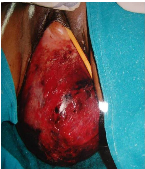
Fig 1. Prolapsed cervical myolipoma